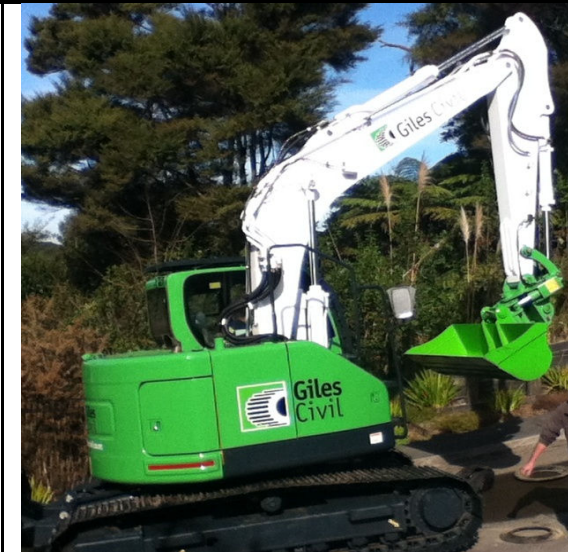
Hyundai 145CR-9 all decked out

"Yesterday is but today's memory and tomorrow is today's dream."