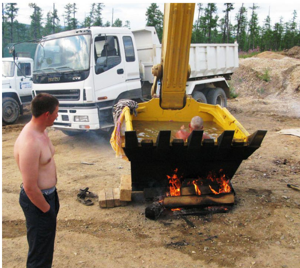
The Man Spa - How Real Men Relax

You just cannot keep Construction workers down