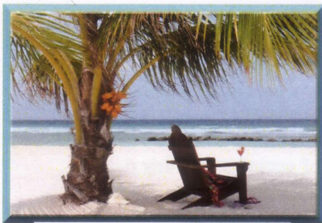
"Wish you were here"

Cricket World Cup Americas Cup Rugby World Cup Netball World Cup