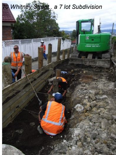
70 Whitney Street.. a 7 lot Subdivision