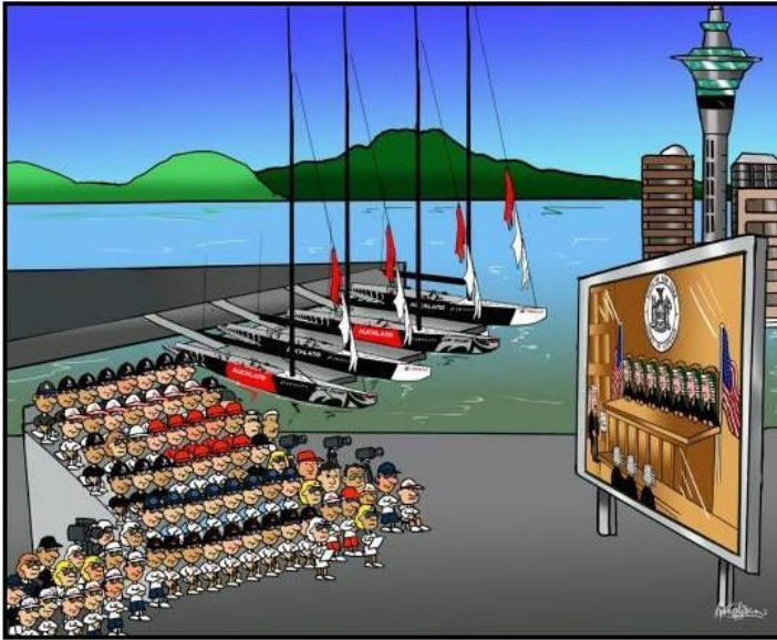
The next Americas Cup Farce is due to happen in February. Cartoon Courtesy of Alinghi website