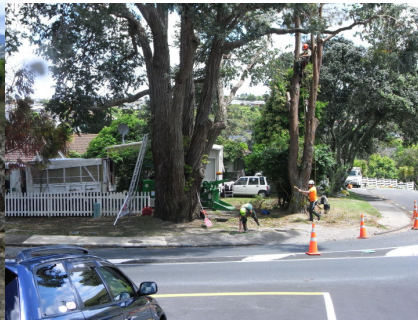
..... & After