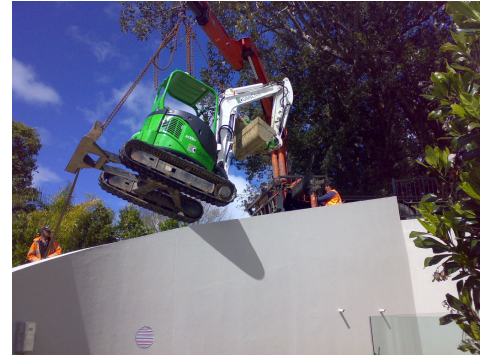
Spotted in Iraq

Our 3.5 digger being lowered into a basement garden in Takapuna. This was to excavate the garden & carry out repairs. The only way in (& out) was by crane.